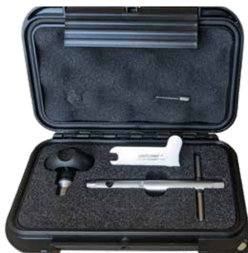
DENTO-PREP™ Service-kit Art. No. 1980

The DENTO-PREP™ Service Kit is a convenient maintenance tool for service departments and end-users. It contains special keys and a cleaning wire to remove blockages inside the fine tubes of DENTO-PREP™ as well as a tool for tightening the activation button. The Service Kit comes with a thorough step-by-step service instruction.