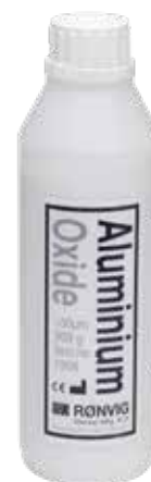
900g Aluminium Oxide 50 µm. Art. No. 1906