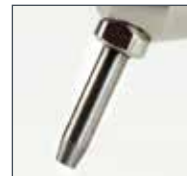
DENTO-PREP™ Spray Tip

DENTO-PREP™ is covered by a 2-year material and construction guarantee with the exception of the spray tip. DENTO-PREP is engraved with a 9-digit LOT number of which the first 4 digits indicates year and month: YYMM.